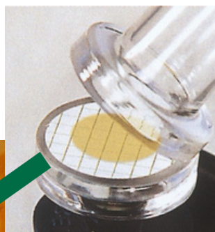
Naked eye view showing varnish